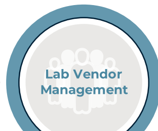
Acceleration through coordination